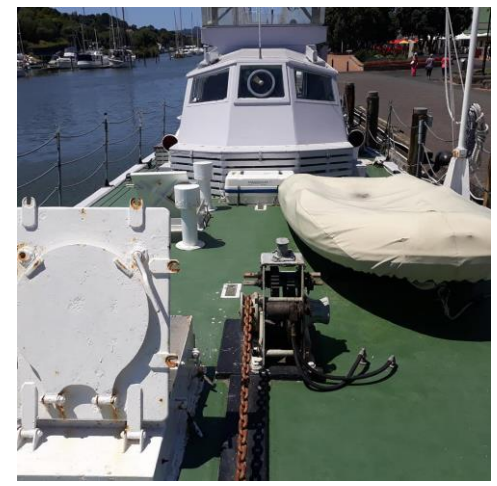
Kuparu - 2016