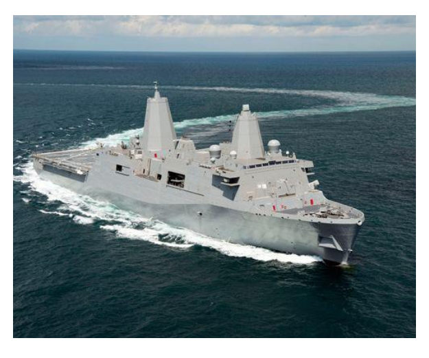
USS San Diego

The USS Philippine Sea (CG-58) is a Flight II Ticonderoga-class guided missile cruiser on active service in the United States Navy. She was built by Bath Iron Works in Bath, Maine. Her keel was laid on 8 April 1986 and she was launched on 12 July 1987. Upon completion of her sea-trials after construction, Philippine Sea transferred to the Atlantic Fleet and was commissioned on 18 March 1989 in Portland, Maine. She is powered by a General Electric LM2500 gas turbine that includes two controllable-reversible pitch propellers and rudders. She can reach a top speed of 32,5 knots (60 km/h). She has a length of 173 m, a beam of 16,8 m and a displacement of 9800 tons. The cruiser has a crew of 330 sailors.