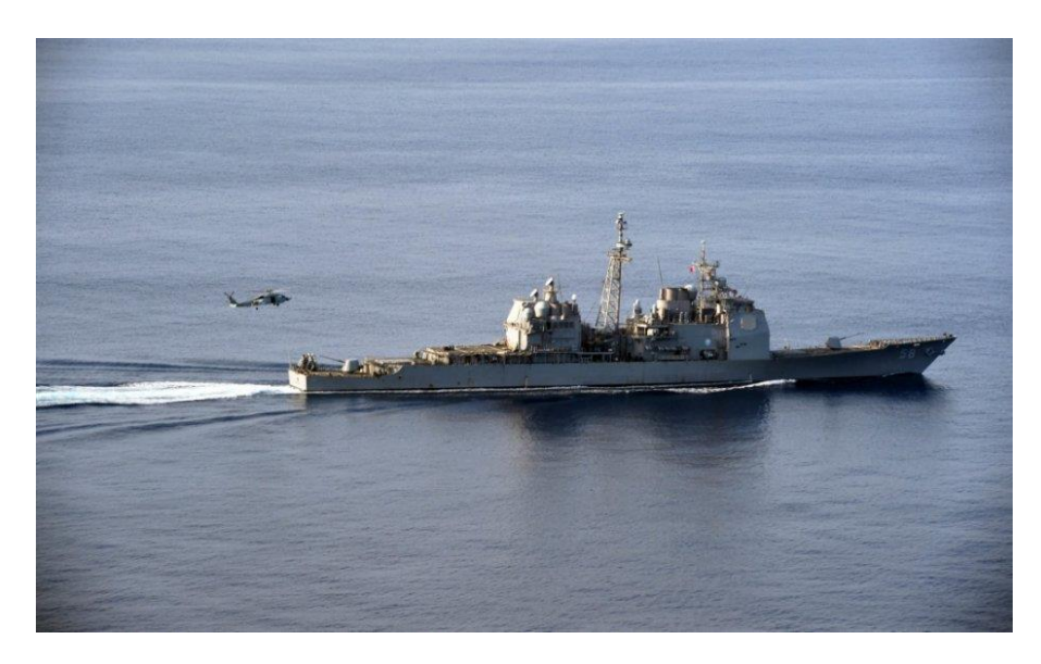
USS Philippine Sea