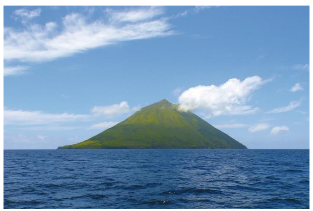
The inhospitable island of Tofua