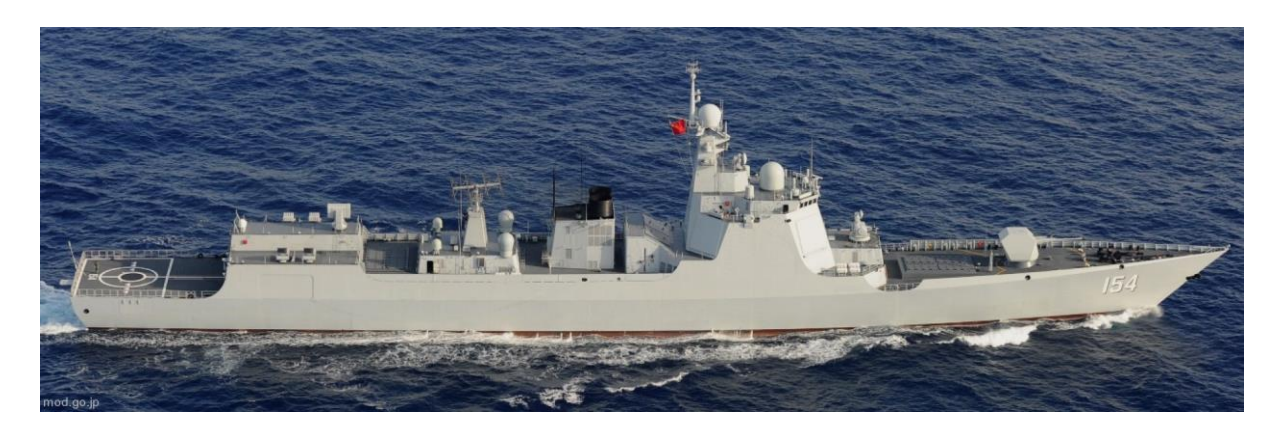
Luyang Class guided missile destroyer