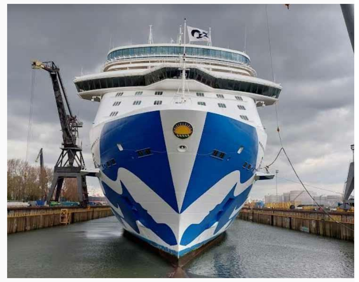
Sky Princess entering dry dock in Rozenburg, Rotterdam

There was a distinction between the Q class boats which were permanent navy and the NAPs which were a completely separate division that was part time navy, in some ways a naval version of the home guard. The crews were never on patrol long enough to suffer the rigours of close confinement in all weathers. The