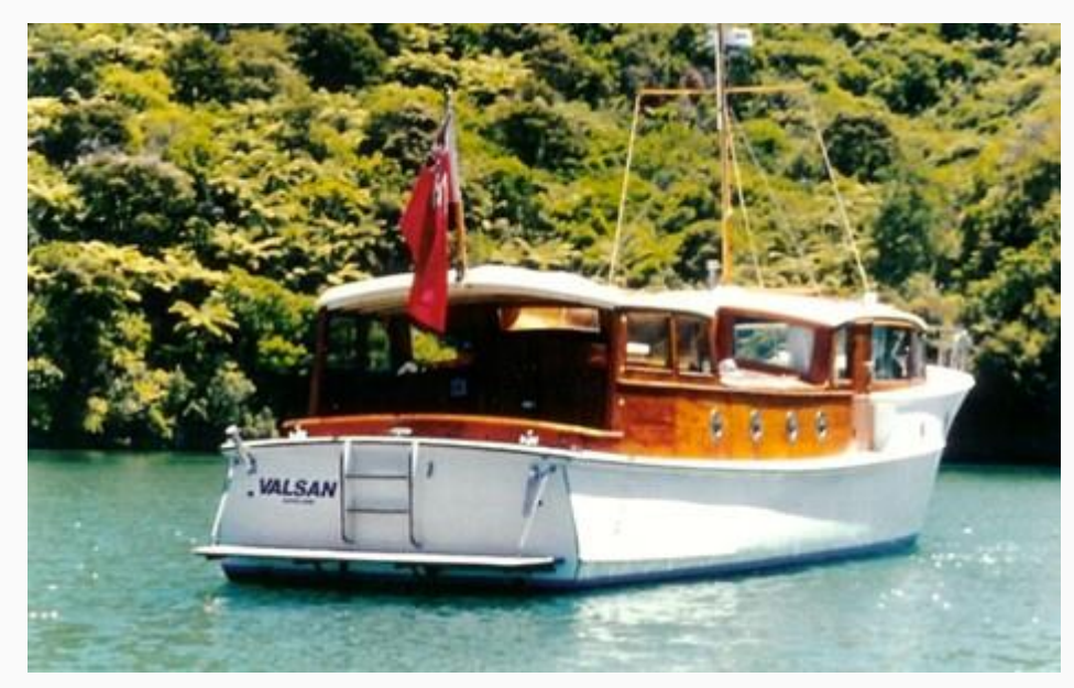
Looking very smart in this recent photo