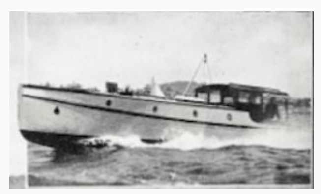
Defender showing a turn of speed.