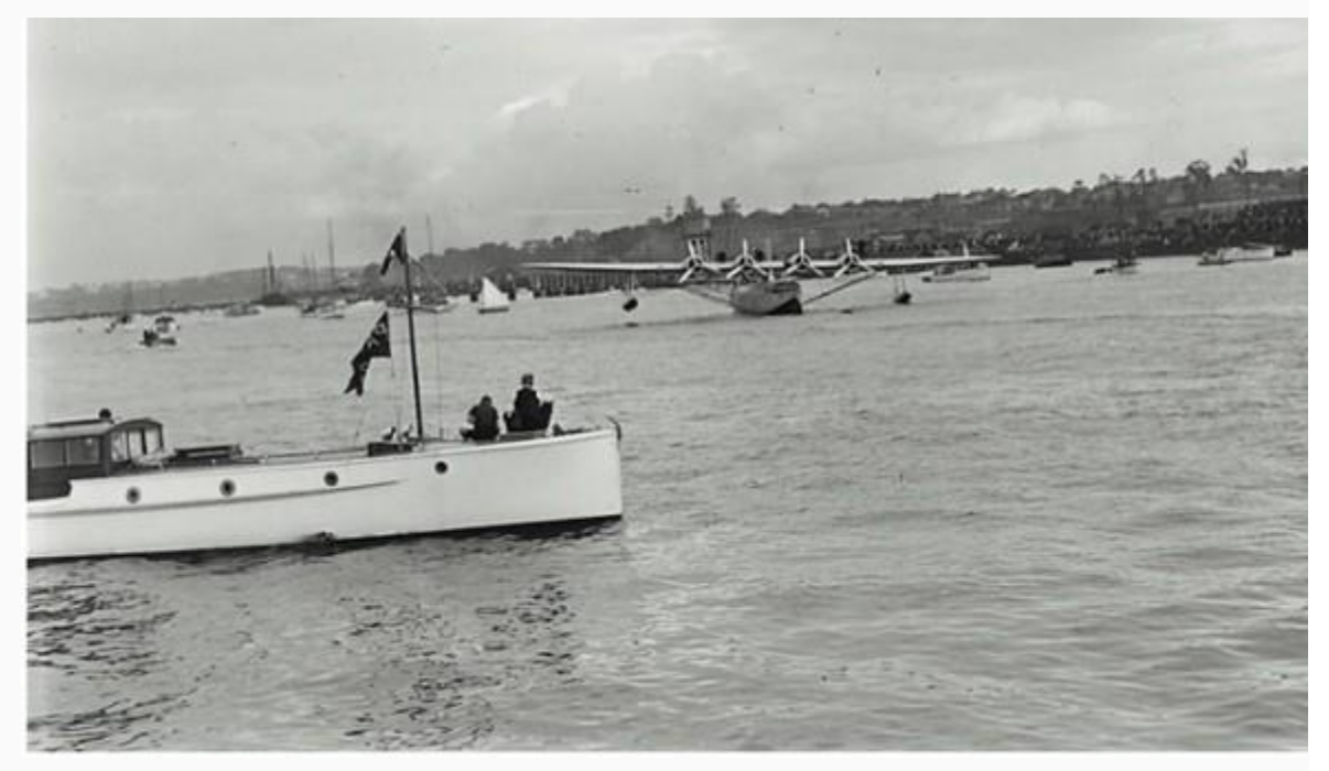
Defender at Mechanics Bay