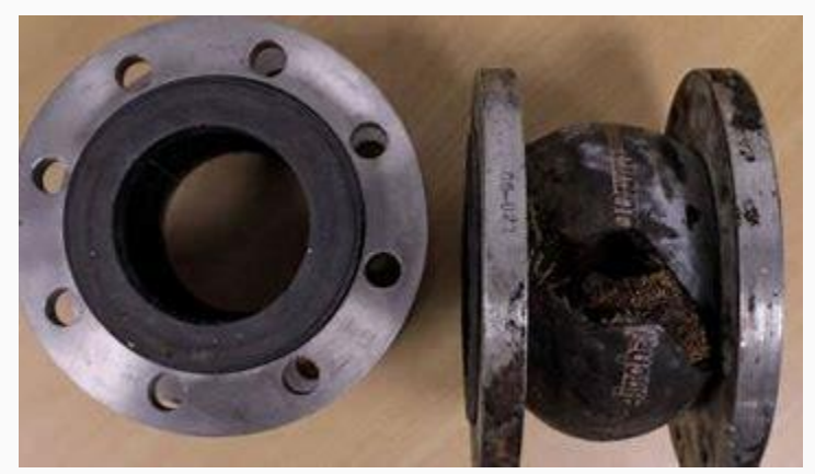
New and old coupling