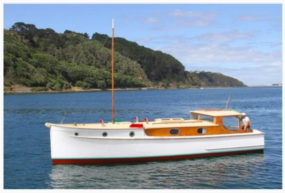
Kenya now named Mataroa 2023