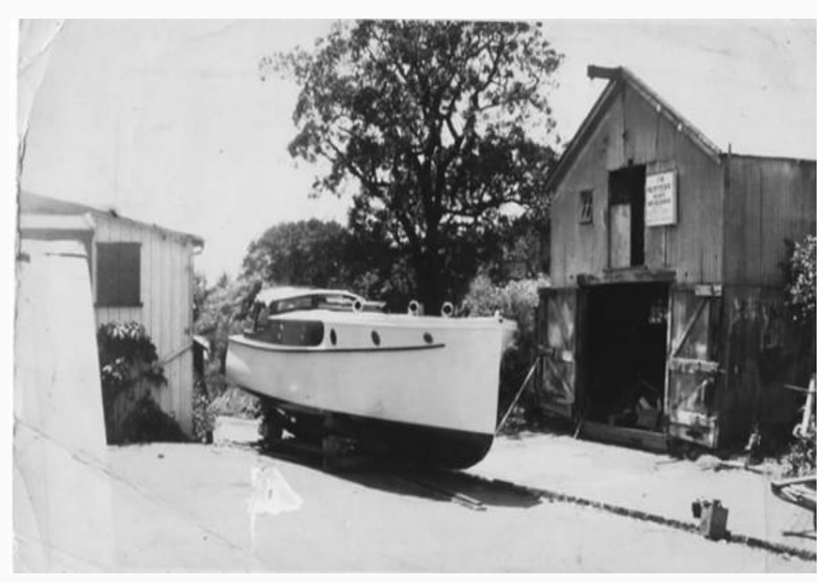
Kenya as launched – 1928 at Judges' Bay, Auckland