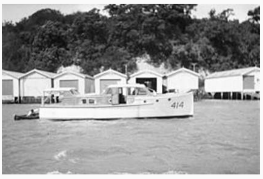
Playmate at Whakatakataka Bay, Auckland. Probably 1942