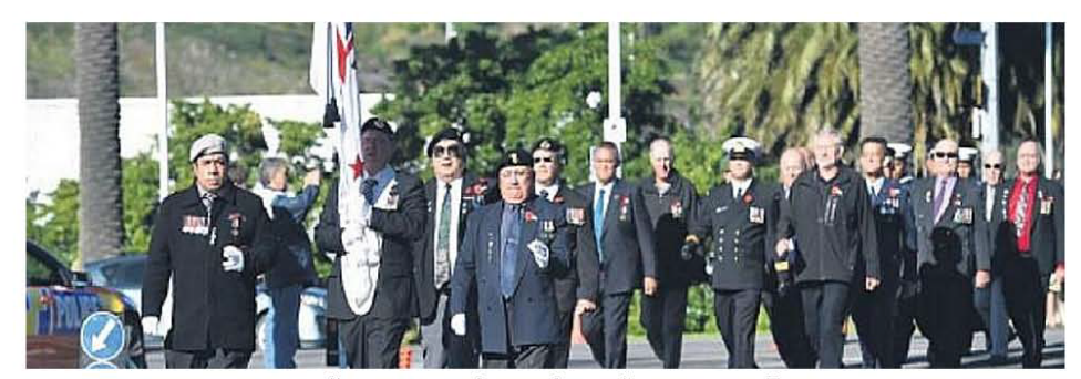
"We march in their footsteps."

The true essence of any ANZAC parade is to have two Parade Marshalls. This will ensure quality supervision, that your parade is formed up in the correct order and ensure there is verbal direction throughout the march.