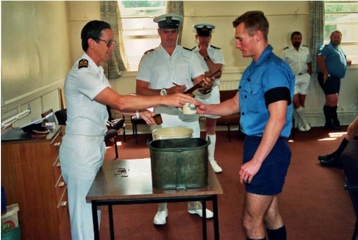
Last rum issue - Philomel 1 March 1990