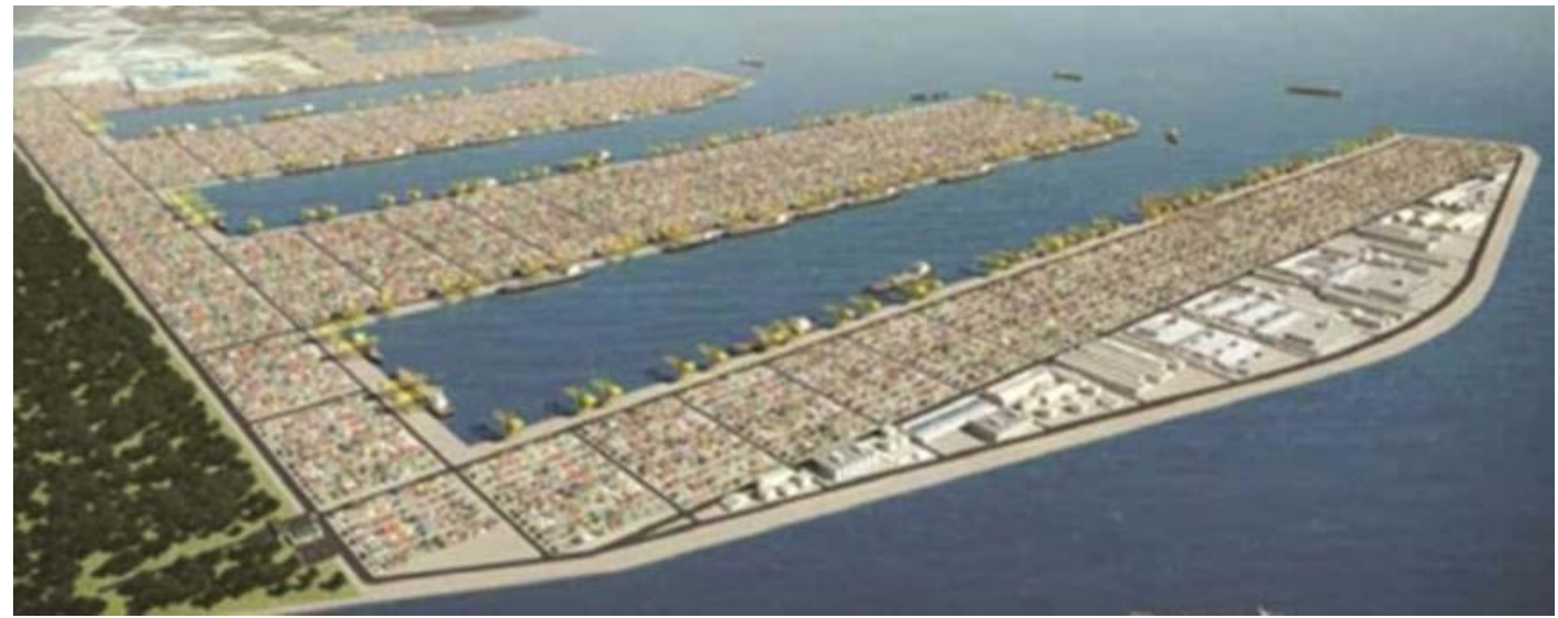
Artists impression of the new Tuas Container Terminal