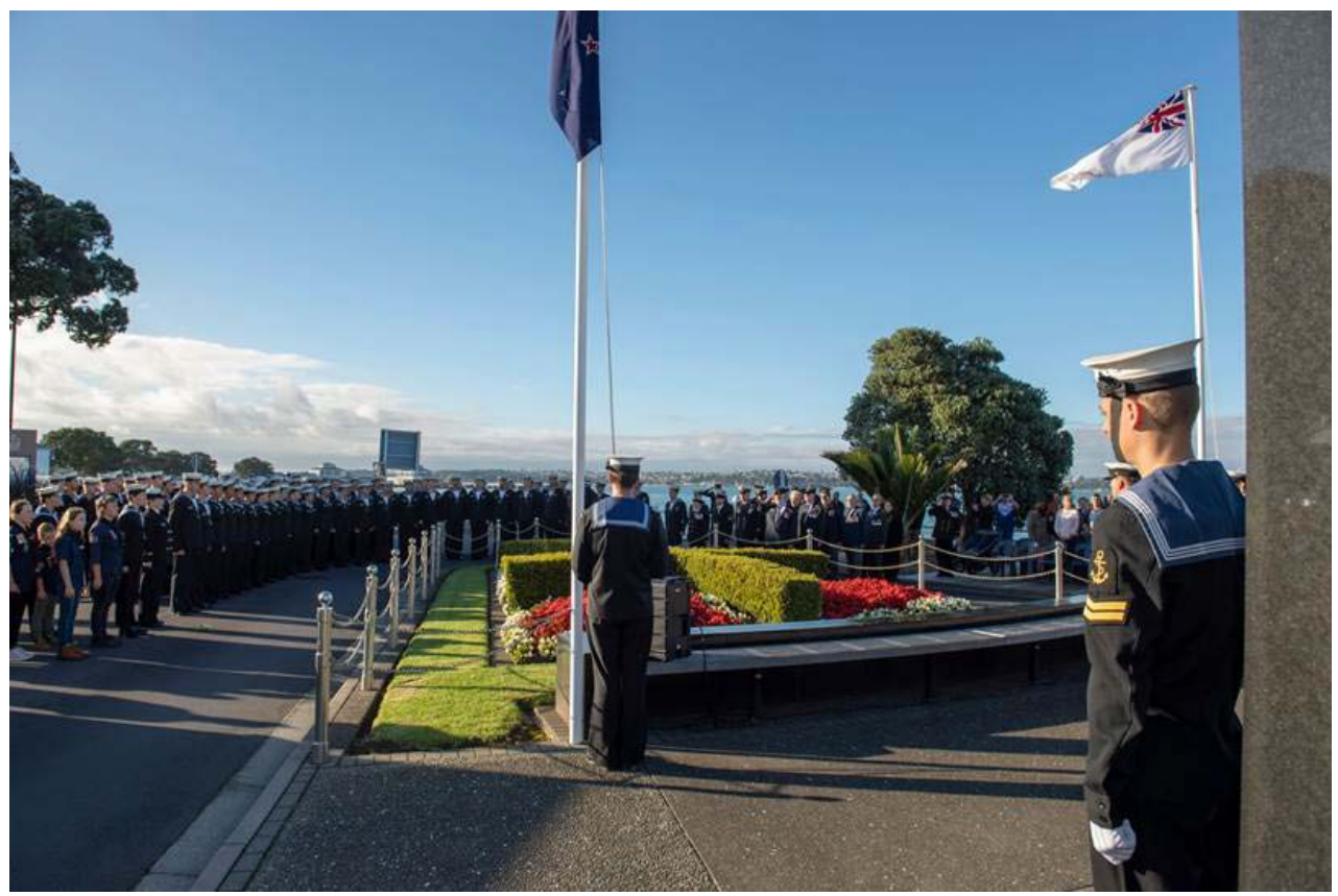
ANZAC Parade - DNB