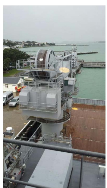
Manawanui - 100 tonne crane