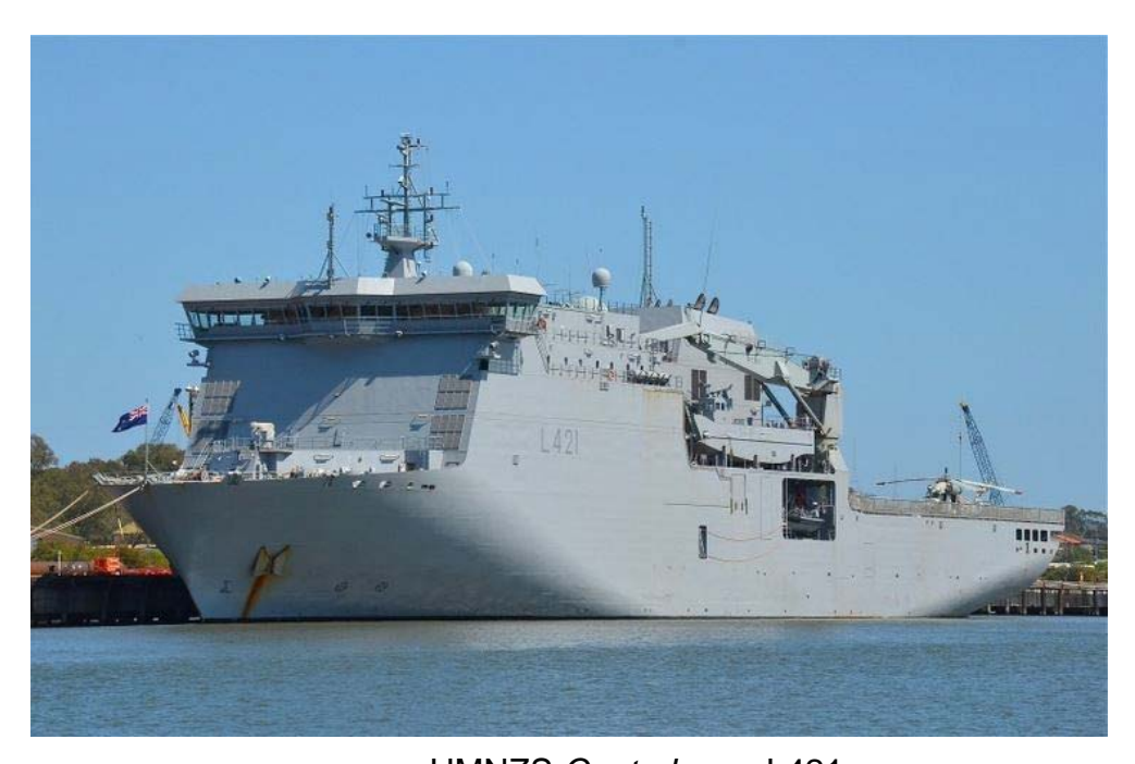
HMNZS Canterbury - L421

The ship also carries two Landing Craft. The landing craft have a length of 23 metres (75 ft) and a displacement 55 tonnes (empty) to 100 tonnes (loaded with two NZLAVs. Canterbury is able to accommodate up to four NH90 helicopters for deployment ashore in support of New Zealand Army operations and disaster relief activities.