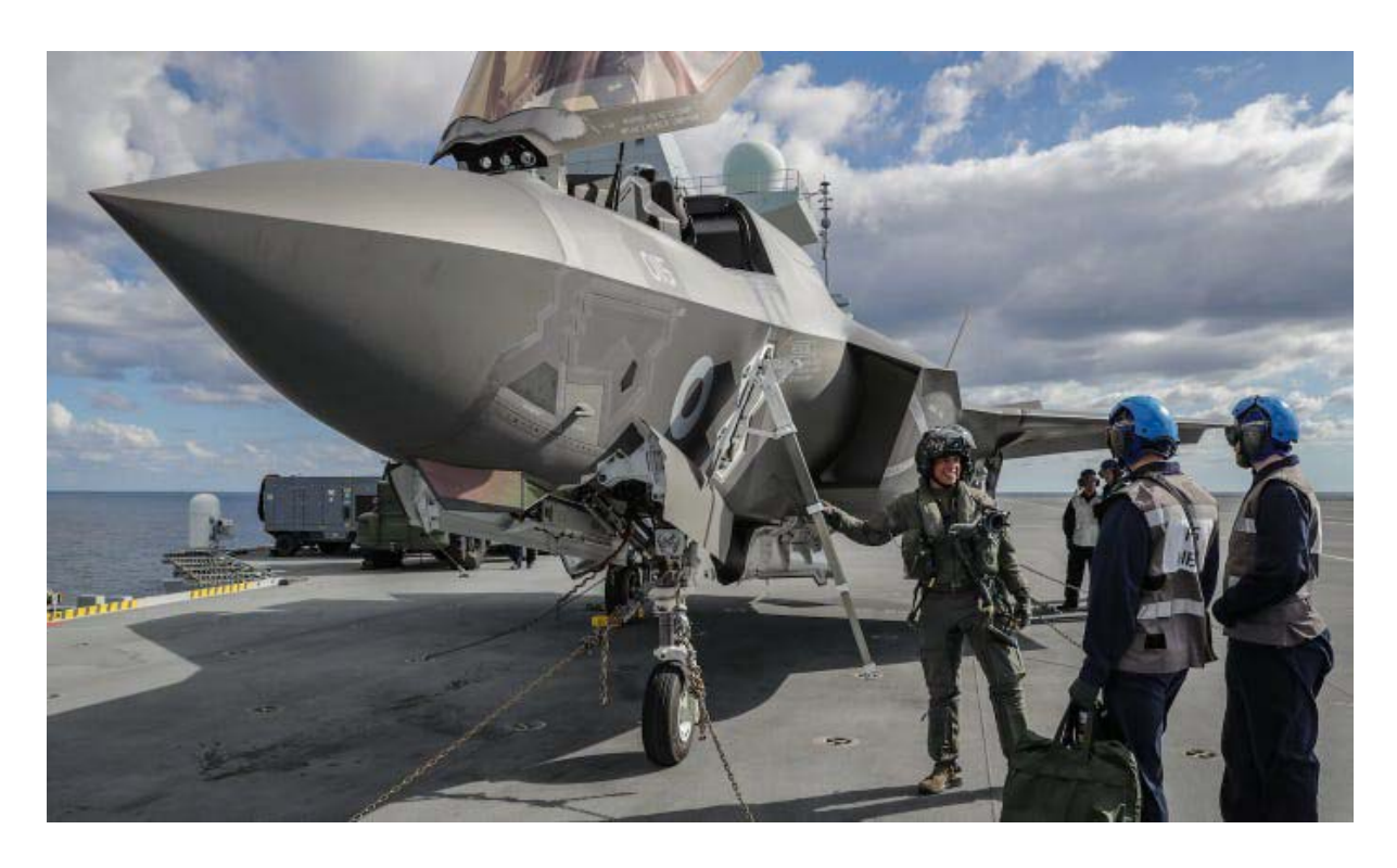
F-35 on board HMS Queen Elizabeth