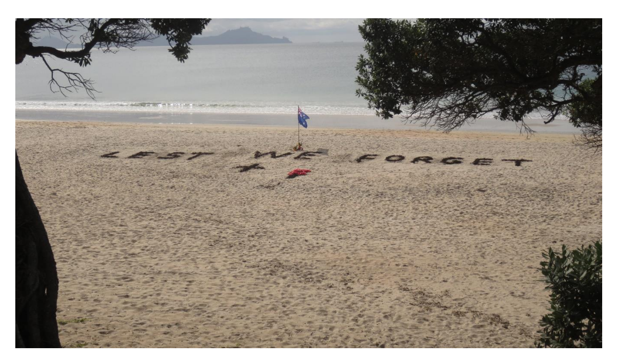
Whangarei heads on the horizon