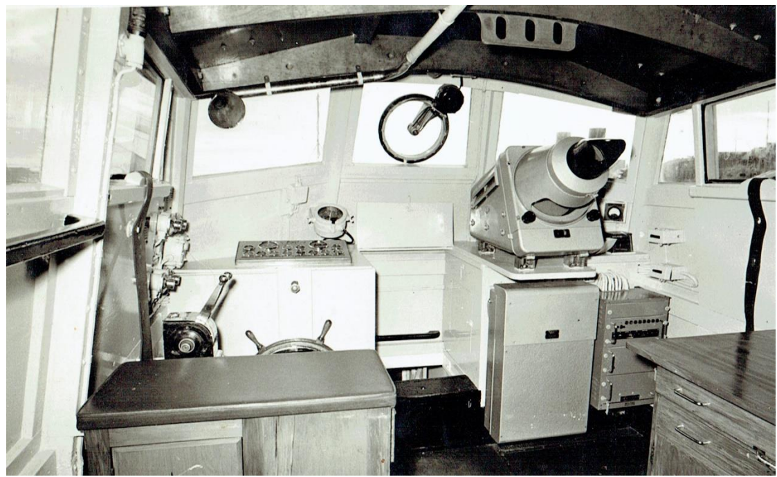
Wheelhouse - HMNZS Manga