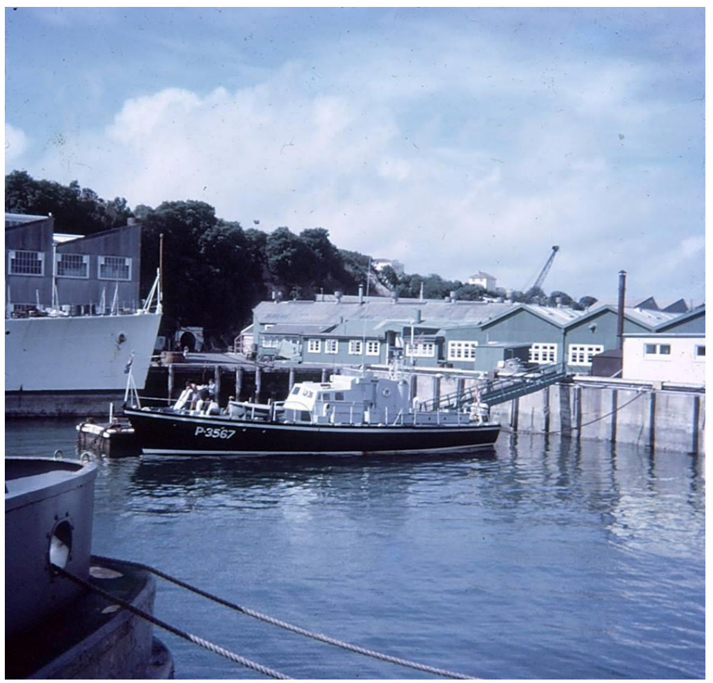
HMNZS Manga alongside the ML Pontoon, Philomel