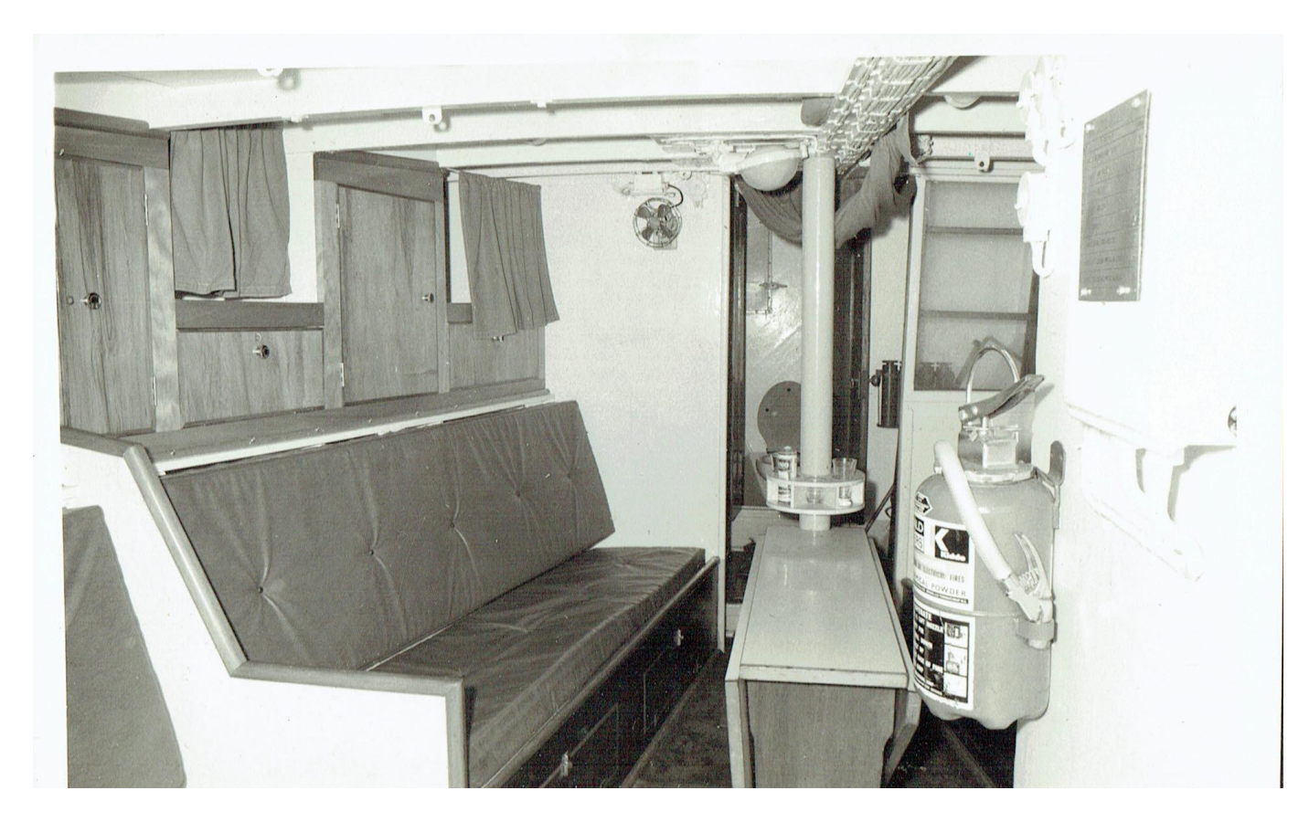
Many memories of the For'd Mess