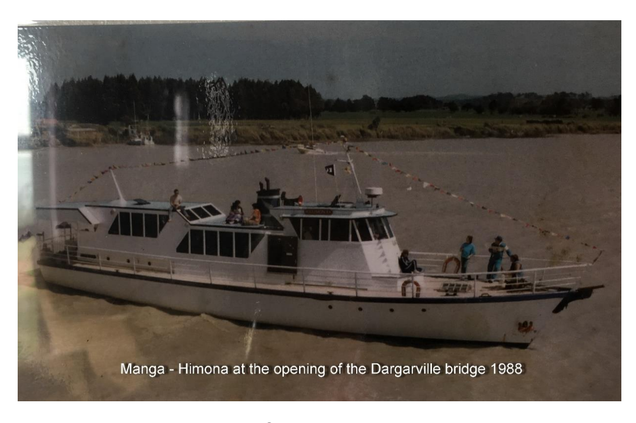
On the Kaipara