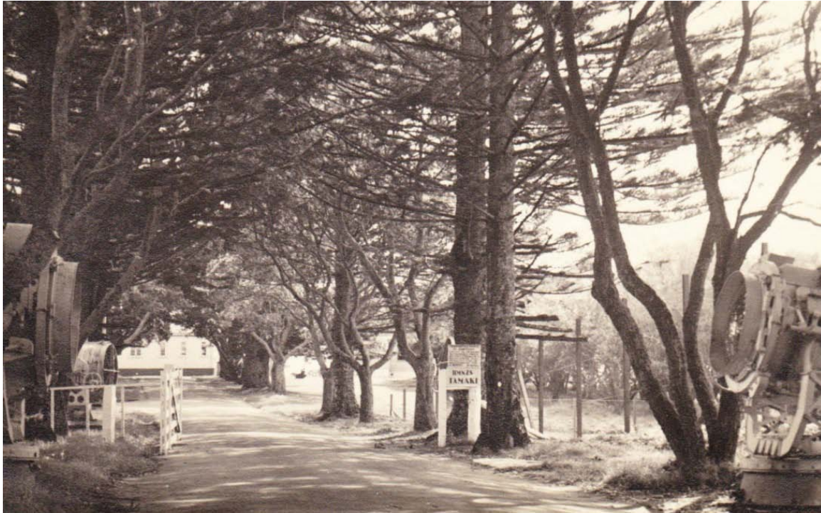
HMNZS Tamaki , Motuihe Island

The “Survivors of the Rock” reunion will be held on 14-16th February 2020. Visit the website for further details.