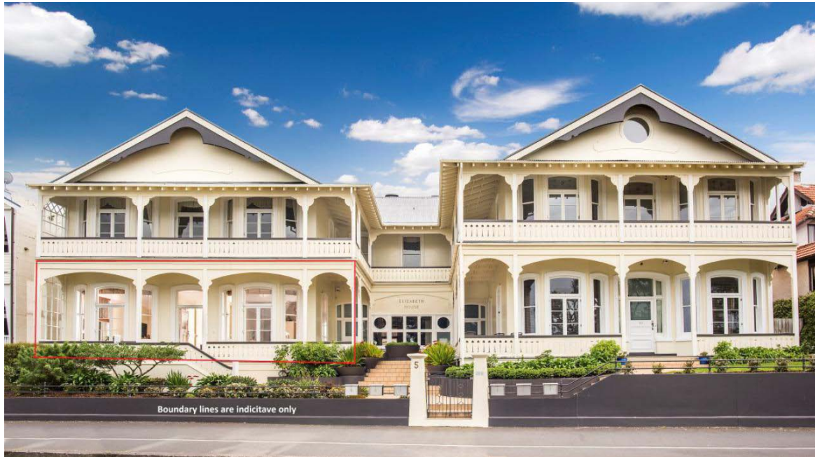
Elizabeth House, Devonport

On 14th March 1991, Elizabeth House, 5 King Edward Parade, Devonport was sold by the RNZN for $800,000. In July 1951, the Venter Hotel was purchased by the RNZN to be the barracks for the WRNZNS. A year was taken up with refurbishment and the first group of 71 Wrens arrived in July 1952. This was christened as Elizabeth House. The original kauri house was destroyed by fire, rumored to be started by a defaulting guest. The plastered brick replacement was built in 1914. The building sold again in 2009 for $1,450,000 and again in 2016 for $3,000,000.