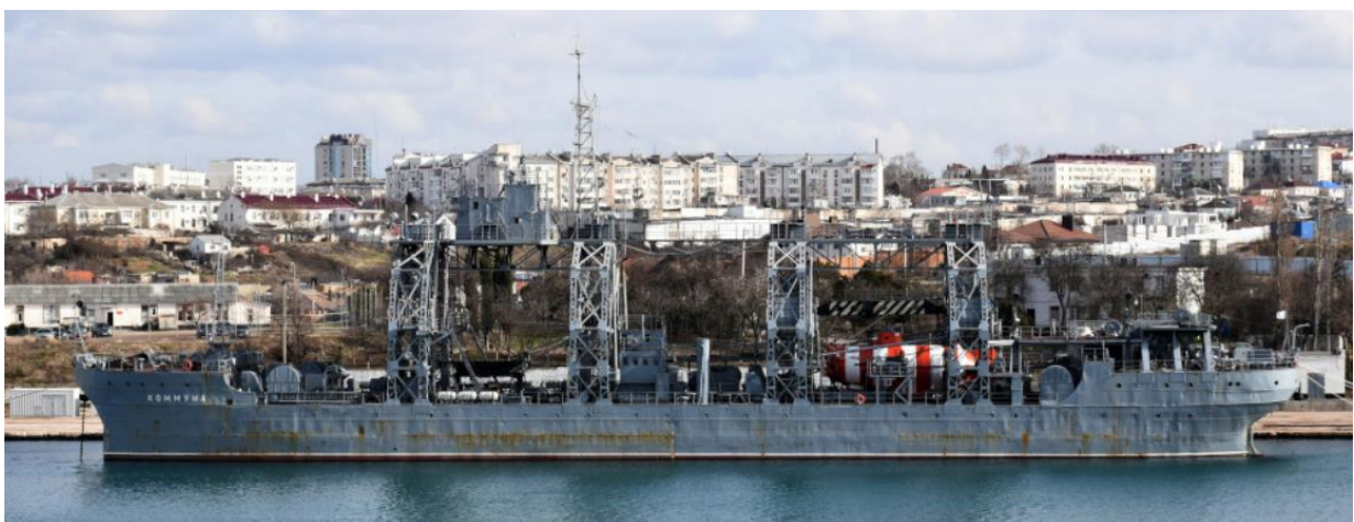
Kommuna seen in Sevastopol, February 2022. Note the red and white mini-submarine.

However, as submarines grew in size and rescue and salvage technology matured, this became outdated. However, small rescue submarines could be carried and deployed via the central well, and the ship lived on. It is almost certainly one of the oldest active warships of any major navy.