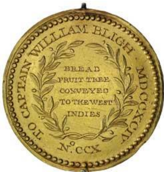
The Royal Society of Arts Gold Medal awarded to William Bligh