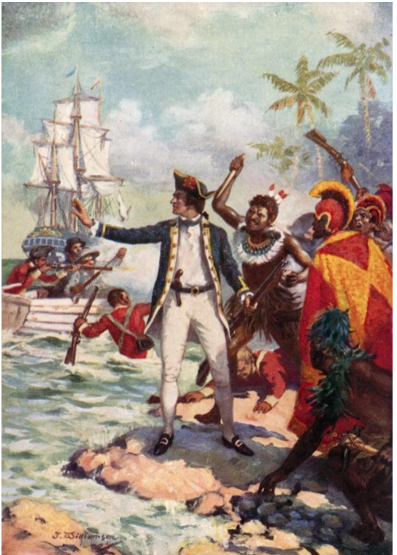
Death of Captain Cook, Hawaii, 1779