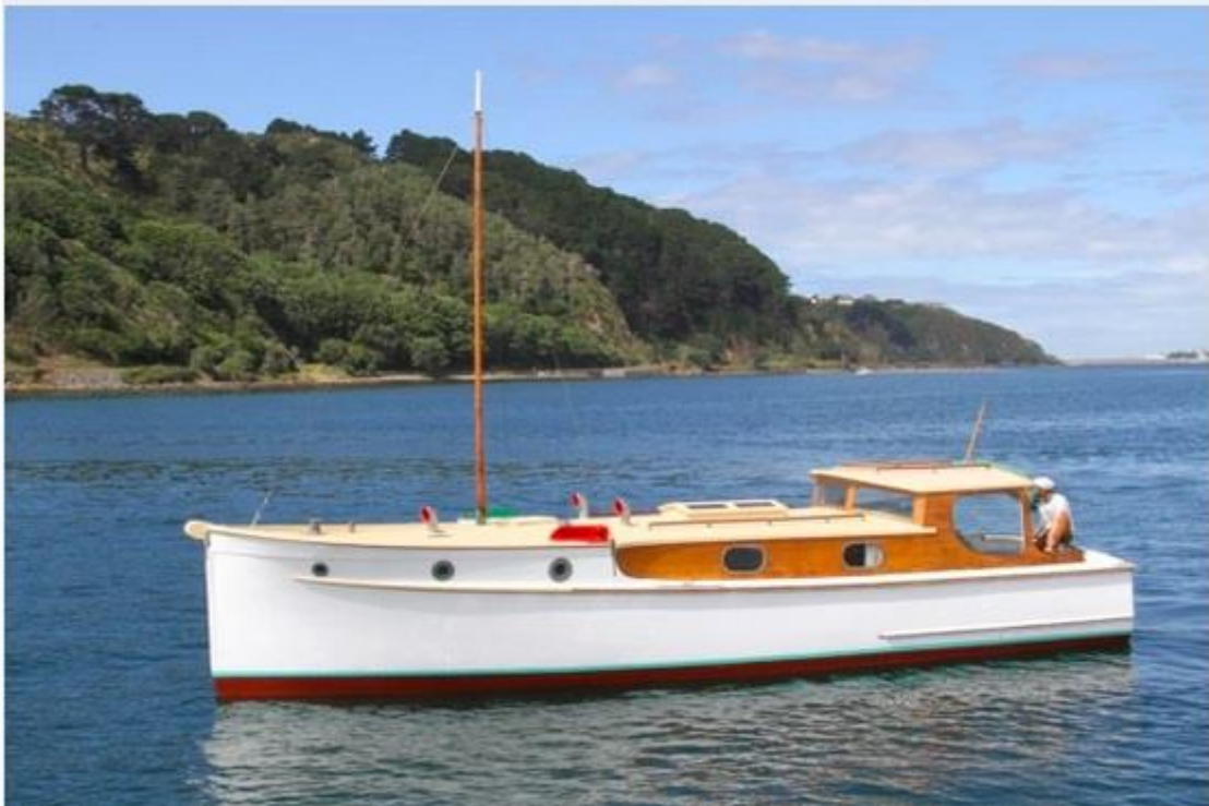
Kenya now named Mataroa 2023