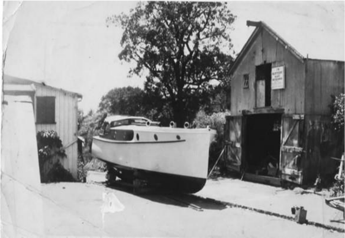
Kenya as launched – 1928 at Judges' Bay, Auckland