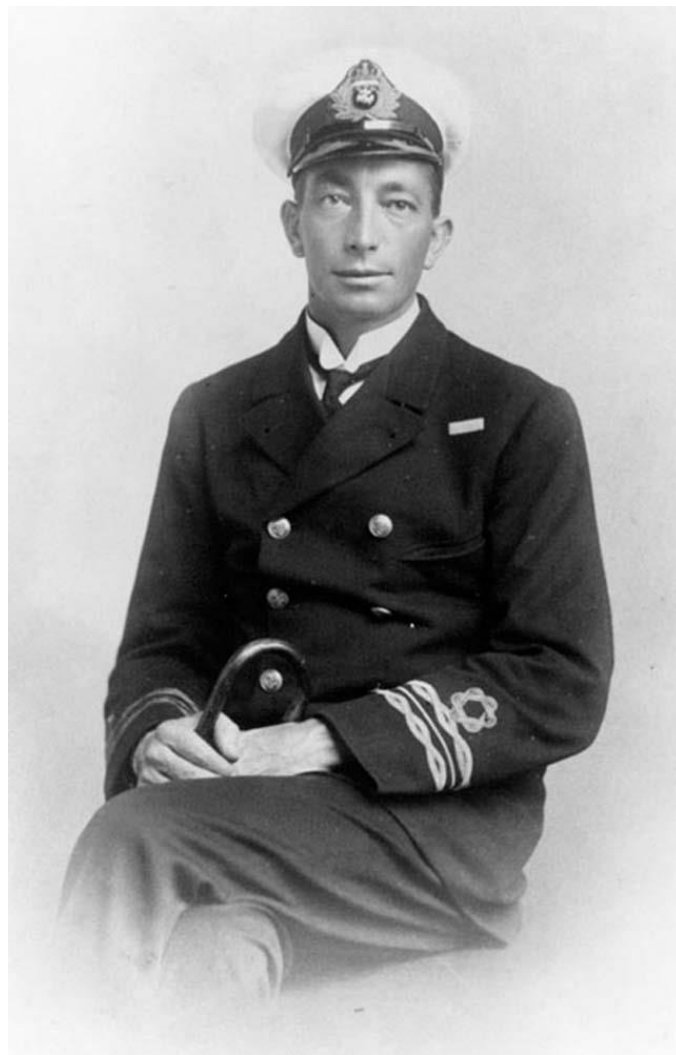
'Gunner Billy' LtCdr WE Sanders, VC, DSO, RNR

Several memorials exist to Sanders' memory, including the Sanders Cup, a sailing trophy for 14-foot (4.3 m) centreboard yachts.